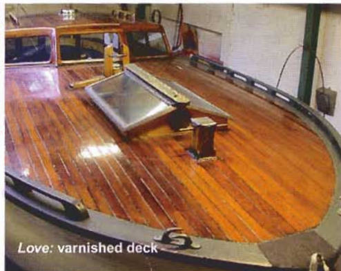
Love : varnished deck